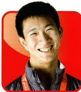
蘇樺偉 SO Wah-wai